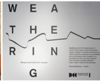
Weathering at Tent London